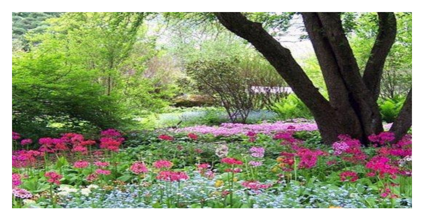
Day 6, May 24, 2023 -- Stockbridge to Williamstown, 47 miles, 4313' or 49 miles, 2858' (no Greylock, rail trail option)

A day for the climbers! This ride will take us up Mt. Greylock, the highest mountain in Massachusetts. Lunch will be at the top with beautiful views of the surrounding area. After lunch, it's a long gradual descent into the town of Williamstown, where we will stay for two nights. Williamstown is a small college town with a focus on art. You might want to visit some of the many art galleries and enjoy dinner downtown in one of the restaurants.