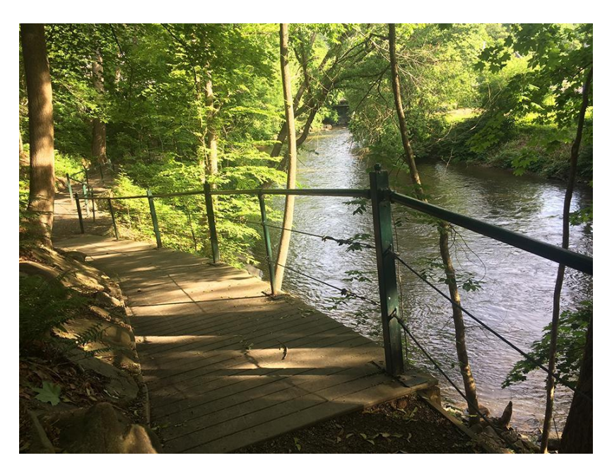
Day 3, May 21, 2023—Bish Bash Falls, 49 miles, 3084'Today's loop from the hotel takes us southwest to climb through Mount Washington State Forest to Bish Bash Falls, the highest waterfall in the state of Massachusetts. The falls are made up of a series of cascades nearly 200 feet in total. A sag stop there will allow you to bring shoes for the short hike to the falls.

We leave the city of Albany, the capital of New York, and cycle through farmlands into the rolling hills at the foot of the Berkshires. We will spend two nights in Great Barrington, the epicenter of the southern Berkshires. The town has many restaurants and shops to explore within walking distance from the hotel. The Housatonic Riverwalk is a lovely stroll along the river just steps off Main Street.